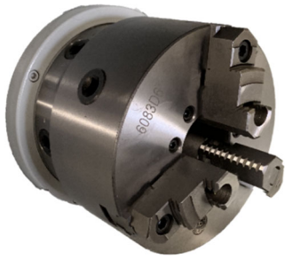
8" 3-Jaw Chuck