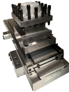
Auto 4 Way Tool Post EL