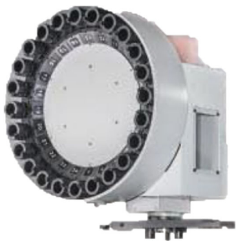
24/30 Tools Arm type ATC