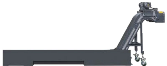
Chain Type Chip Conveyor