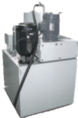
Coolant Through Spindle