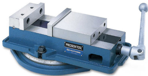
6" Angle Vise (Made in Taiwan)