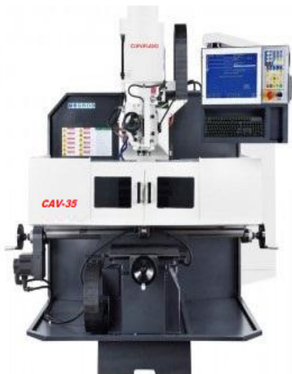
Table Guard is optional