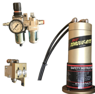
Power Draw Bar