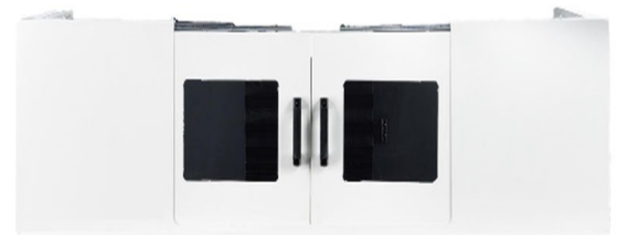
Table Guard with 2 Lexan doors