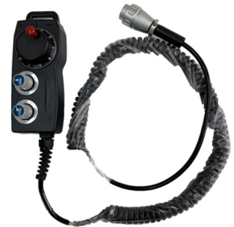
100 Step MPG